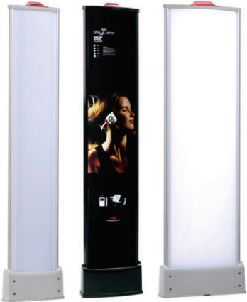
Variety of Styles Available

AdGuard is a family of feature rich Electronic Article Surveillance systems compatible with all 58Khz acousto-magnetic tags and labels.