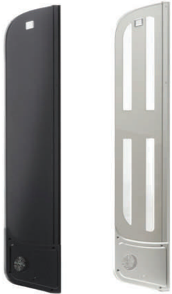
Variety of Styles Available

Diamond Door Guard is a feature rich Electronic Article Surveillance system compatible with all 58Khz acousto-magnetic tags and labels.